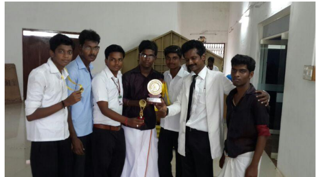
Govt.MGR Best Research Paper Award & Gold Medal