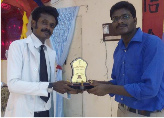
The Eminent 'Govt. MGR Reverse Vaccinology Oration Award'