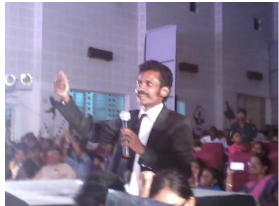
Delivering the reputable 'Ralph Millard Cleft lip & Palate Oration'