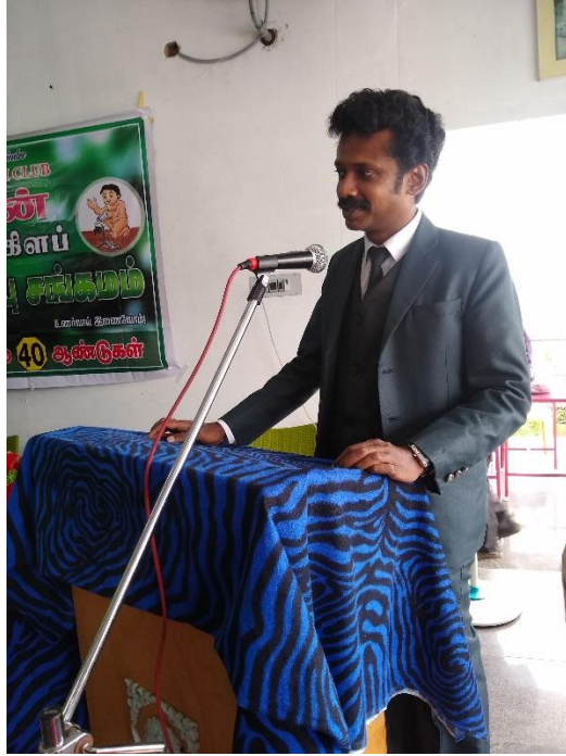
Receiving the 'Edward Jenner Medical Oration' Award