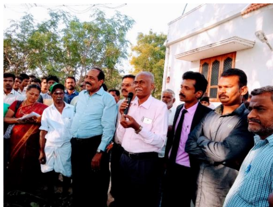
Launching the 'Indian Rural Medical Awareness Campaign'