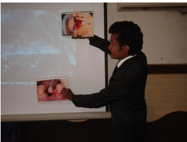
Delivering the Distinguished 'The Kruger Bone Grafting Oration'