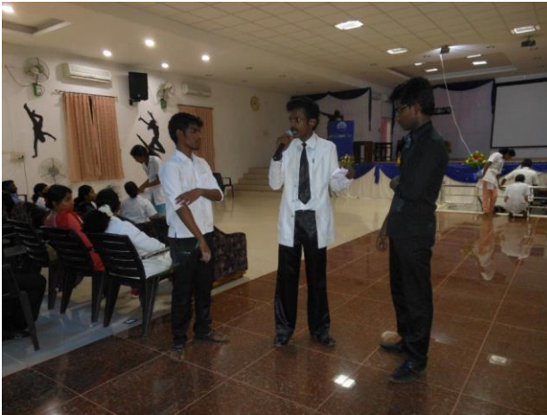
Conducting the 'Govt. MGR University PG Entrance Symposium'