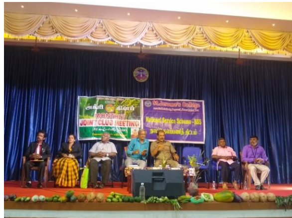
Presiding the Govt. Manonmaniam Sundaranar University Conference