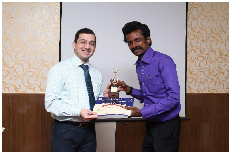
Receiving the ‘Medical Trophy’