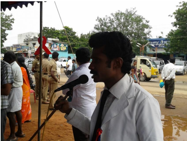
‘Govt. MGR Rural health Oration’

Inaugurating the Spiritually Significant ‘National Ayya Vazhi Medical Awareness Campaign’