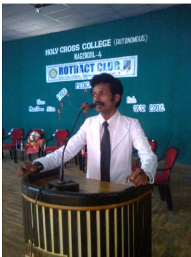
The Esteemed 'Manonmaniam Sundaranar Oration'