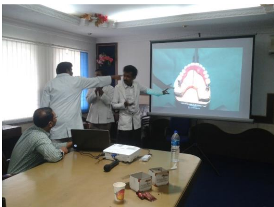
Presiding over the 'Prosthodontic Implantology Convention'