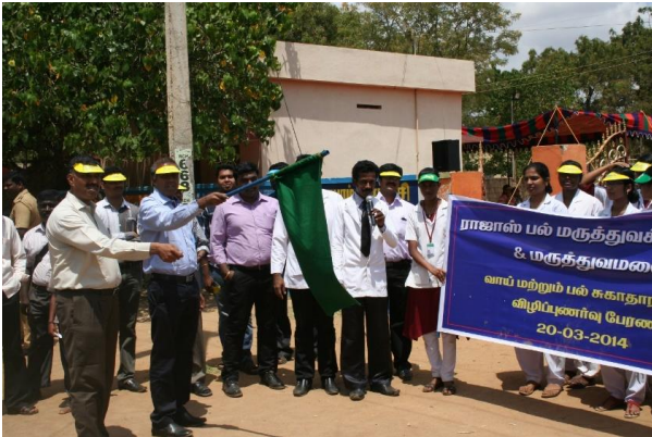
Inaugurating the Govt. MGR Dental Awareness Campaign