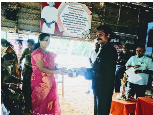
Receiving the Esteemed ‘Ayya Vazhi Medical Oration Memento’