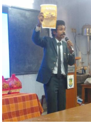
The Prestigious ‘Marie Curie Medical Oration Award’ from YMCA Colleges,India