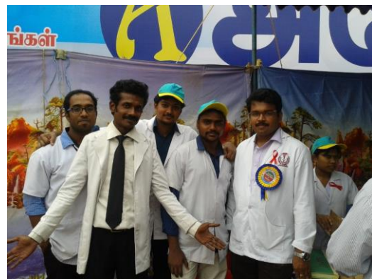
The Eminent ' Govt. MGR Louis Pasteur Reverse Vaccinology Orator'